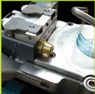
New cooling welding time indicator